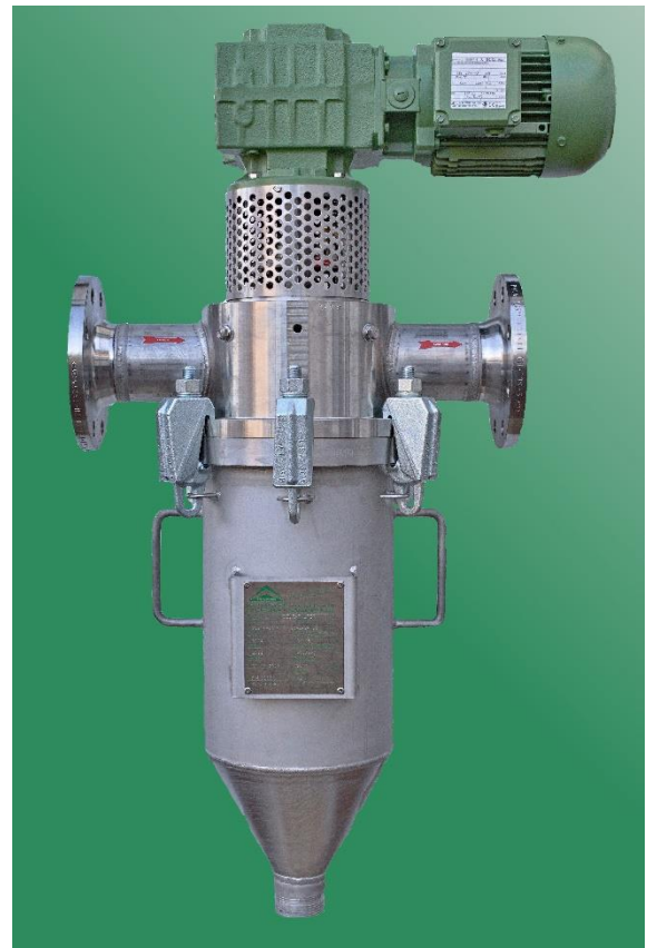
DELTA-STRAIN 480-S/L-KLS, 1.4571, 16 bar

⊕-protection ATEX-conformable acc. to directive 2014/34/EU, perforated elements for gel-like particles, fibres, algae etc., filter elements in hardened design for lifetime improvement, spring loaded scraper blade, self-re-stressed gland unit, special voltage, special seals, automatic drain-system, sluices, heating jacket, differential pressure indicator, wall-holder, TÜV acceptance etc.