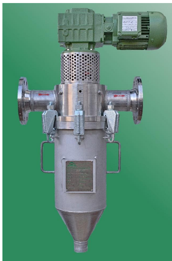
DELTA-STRAIN 480-S/L-KLS, 1.4571, 16 bar

⊕-protection ATEX-conformable acc. to directive 2014/34/EU, perforated elements for gel-like particles, fibres, algae etc., filter elements in hardened design for lifetime improvement, spring loaded scraper blade, self-re-stressed gland unit, special voltage, special seals, automatic drain-system, sluices, heating jacket, differential pressure indicator, wall-holder, TÜV acceptance etc.