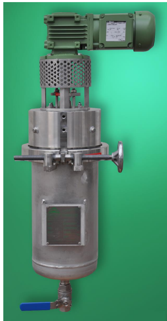
DELTA-STRAIN 480-S/L, 1.4571, 10 bar

⊕-protection ATEX-conformable acc. to directive 2014/34/EU, perforated elements for gel-like particles, fibres, algae etc., filter elements in hardened design for lifetime improvement, spring loaded scraper blade, self-re-stressed gland unit, special voltage, special seals, automatic drain-system, sluices, heating jacket, differential pressure indicator, wall-holder etc.